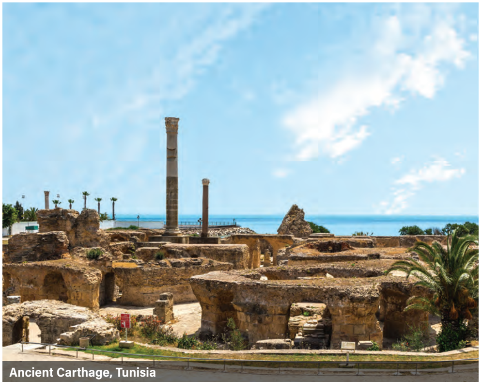
Ancient Carthage, Tunisia