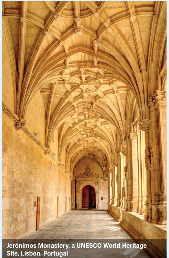
Jerónimos Monastery, a UNESCO World Heritage Site, Lisbon, Portugal

Our activities in the ancient cities of Iberia and North Africa are planned and conducted by a team of expedition leaders and naturalists who are among the most experienced in the field, with several years of leading small-ship cruise expeditions to this incredible region of the world. Members of the team comprise a truly astonishing assortment of expertise and intellect. Onboard and ashore, through talks and presentations they will create a comprehensive understanding of the history, culture, geology, and natural life of this region. The experience we will provide is not just one of awe-inspiring sightseeing, but a complete learning adventure.