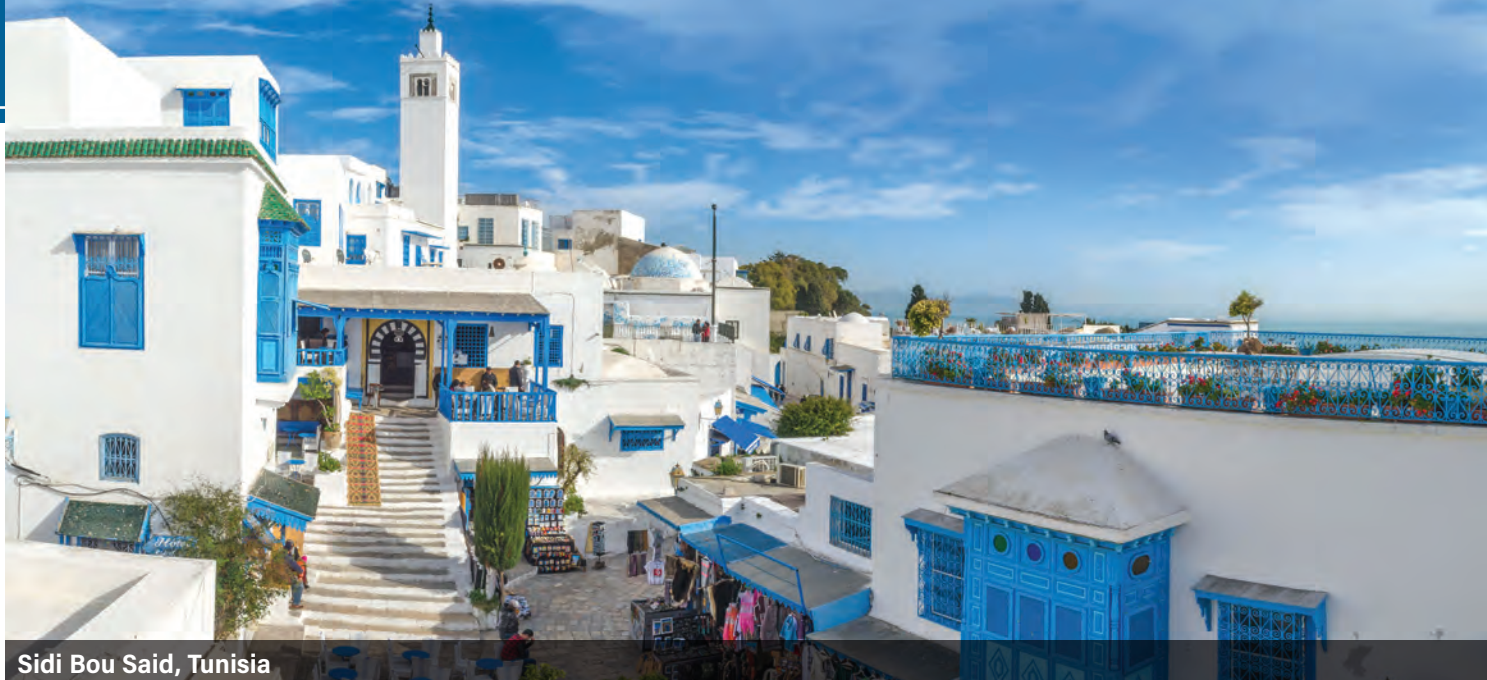
Sidi Bou Said, Tunisia

collection of mosaics and other artifacts. (B,L,D)