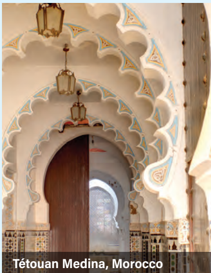
Tétouan Medina, Morocco

NOT INCLUDED: International airfare; travel insurance; expenses of a personal nature; any items not mentioned in the itinerary or the above inclusions.