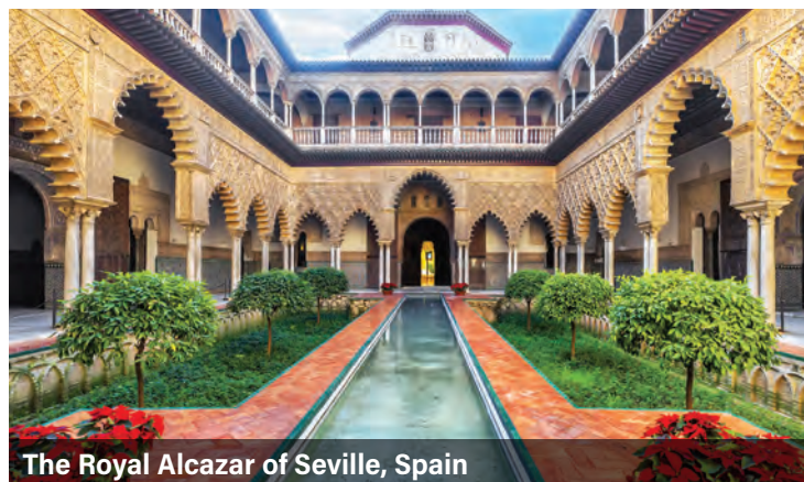
The Royal Alcazar of Seville, Spain