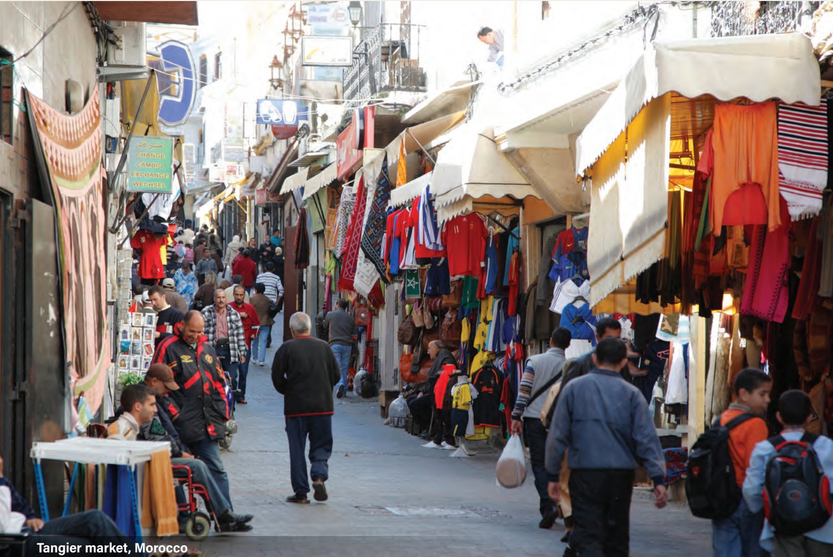
Tangier market, Morocco