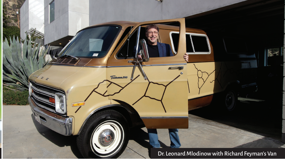
Dr. Leonard Mlodinow with Richard Feynman's Van