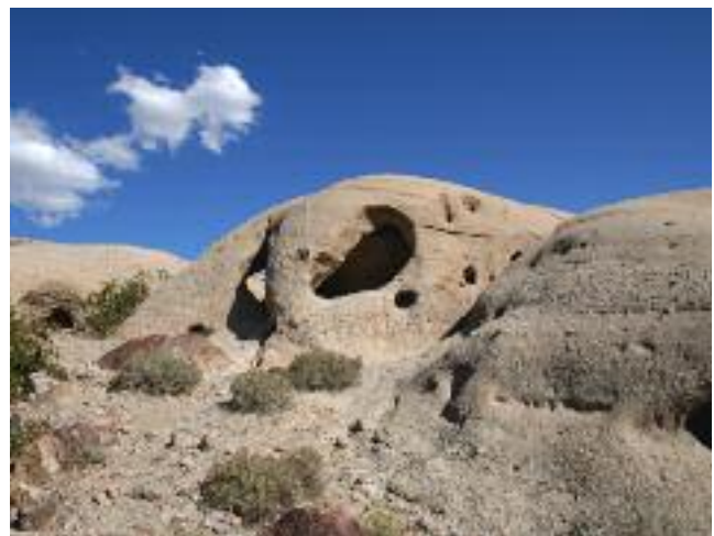
Wind caves.

Our tour will exit the western station of the park (by Twentynine Palms) and return to Pasadena.