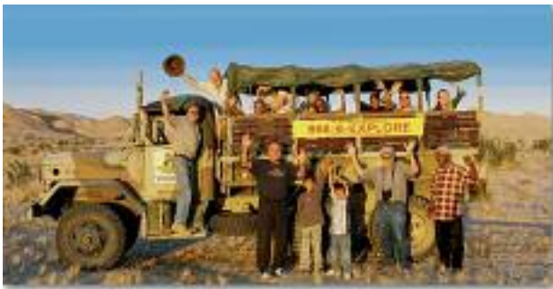
California Overland Desert Excursion's Offroad vehicle. http://www.californiaoverland.com/