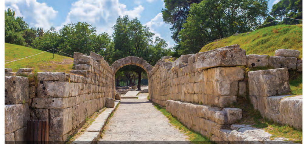
The vaulted entrance to Olympia's stadium, where the ancient games were held. The stadium accommodated about 45,000 spectators.

The Golden Mask of Agamemnon, a funerary mask dating to the 16th century BC. National Archaeological Museum, Athens.